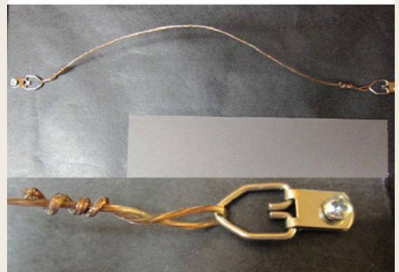
Proper framing hardware.